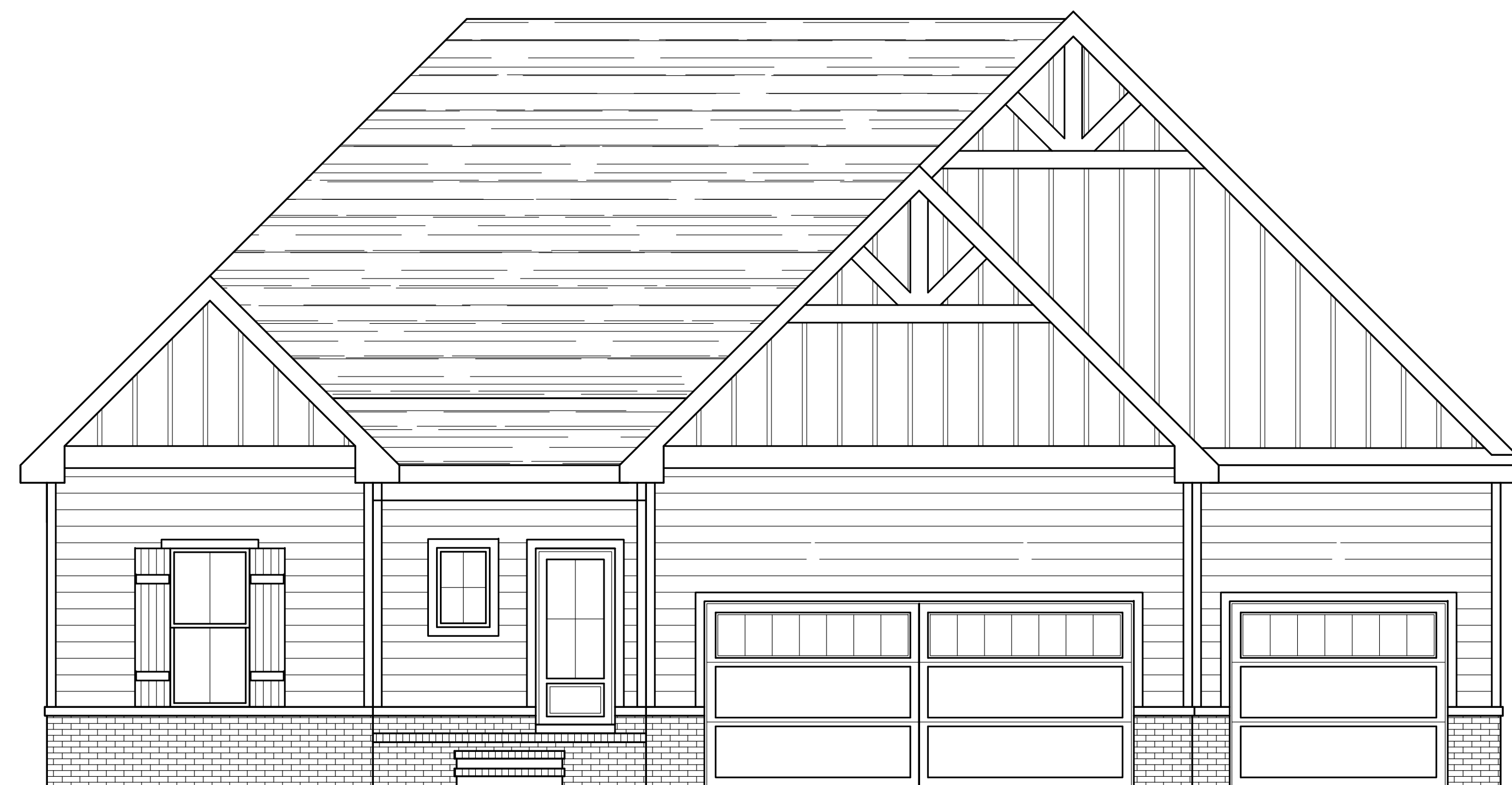
FRONT ELEVATION - A